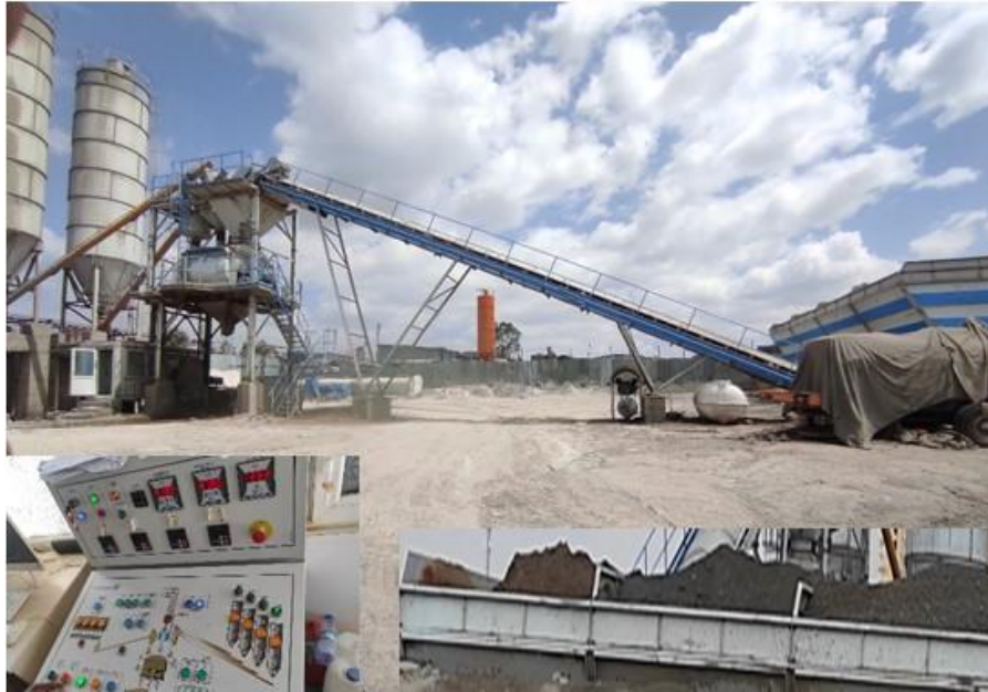
Figure 3. A typical stationary concrete batch plant located in Addis Ababa.

As a composite material of construction, concrete production in batch plants involves the use of water, cement, sand, gravel, and additives for a batch of product. The aggregates, the belt conveyor, and the hoppers for the raw materials are depicted in figure five, which is a photograph taken during the field study on one of the CBPs in Addis Ababa. In the case of Addis Ababa, these raw materials are delivered by tracks, and after the processes, specialized ready-mix concrete trucks deliver the mix to construction sites (Figure 3).