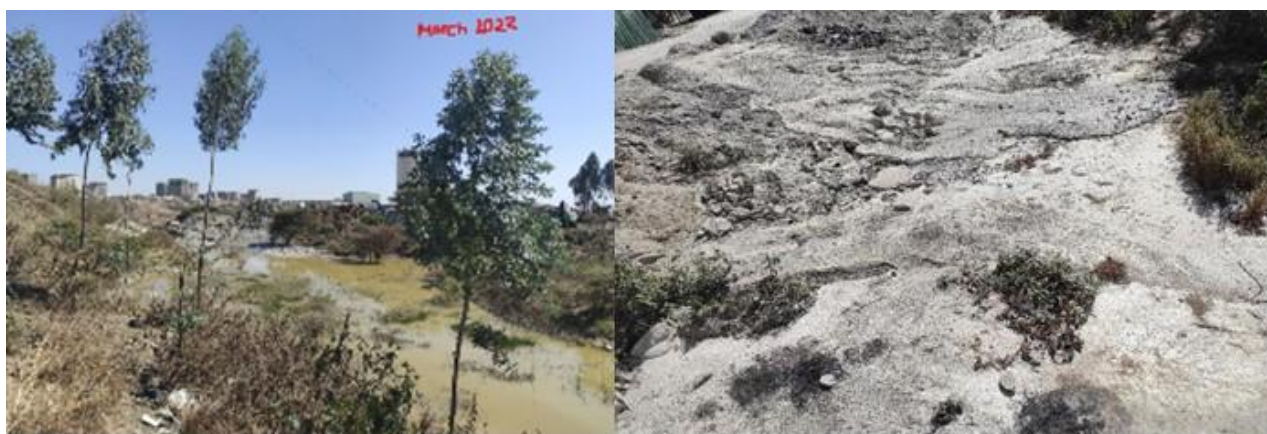
Figure 5. A photograph of surface change of an encroached urban stream, which is a year apart and the cemented gray layer is the place where stream used to flow (right).

The picture in figure five was blue (left) before the establishment of an adjacent CBP and now has turned not to ice white but to concrete white (right). This evident environmental impact needs attention and corrective measure like restoring the topography and the river channel and ultimately the stream itself. As the country has provisions to expand ecotourism on one side and the concrete industry is imposing such kind of impacts, there need to be a coordinated and clear development policy-based action. In fact, concrete wastewater has to be treated (de Paula et al. 2014) before discharge and this should be a primary task for the regulators to ensure if such industry do treat the wastes they release.