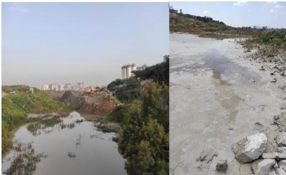
Figure 4. A photographic view of one of the streams encroached by CBPs and its volume of water and color from upper side (left) and the pool of concrete wastewater down stream of it (right).

A glimpse at the current status of CBPs, especially those located within the Bole sub-city of the capital, has been conducted voluntarily and with pictorial evidence. The checklist includes variables of concern such as identifying problems related to site selection for those CBPs, noting the extent of destruction of the urban streams, and the public health concerns basing on expert views. The impression of the current batching practice is undoubtedly undesirable from an eco-centric perspective, as can be seen from clearly negatively impacted adjacent streams (Figures 4 & 5). Indeed, sustainability is a concern in terms of the deterioration of the environmental resources that include water and sand for the same industry as well as other unrelated uses. The fact of the matter is that the leftover concrete, defective batch products, ready-mix concrete delivery tracks as well as mixing and batching vat washing wastewater are simply discharged into the stream, resulting in the cementation of the stream from its bed. Such cement conquest resulted in gray-dying of the streams, where part of the natural hydrologic cycle is even possibly interrupted, and also exacerbated evaporation of the water as the surface area of the stream bed is artificially extended due to such dumping. Indeed, it has already been reported that concrete is among the most damaging materials made by humans (Cooke et al. 2020).