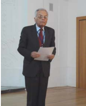
Prof. M. Benedini who was honoured by EWRA during the General Assembly

The Symposium attracted the attention of scientists and experts from several European countries (Italy, Spain, Portugal, Greece, Cyprus, Romania etc.) from countries of North Africa and Near and Middle East and some other countries of the East.