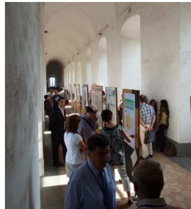
Participants during the poster session