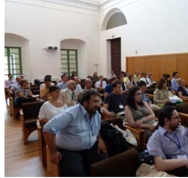
An attentive and involved audience

During the Symposium the General Assembly took place in which: