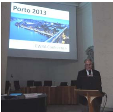
Prof. R. Maia who was announcing the next International Conference of EWRA

The Symposium attracted the attention of scientists and experts from several European countries (Italy, Spain, Portugal, Greece, Cyprus, Romania etc.) from countries of North Africa and Near and Middle East and some other countries of the East.